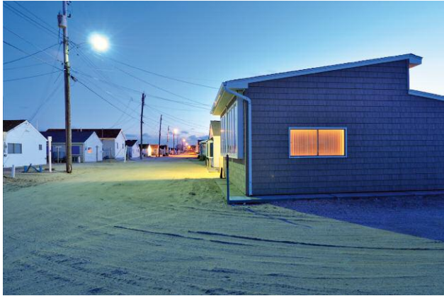
1 © DOUGLAS LJUNGKVIST