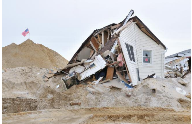
8 © DOUGLAS LJUNGKVIST