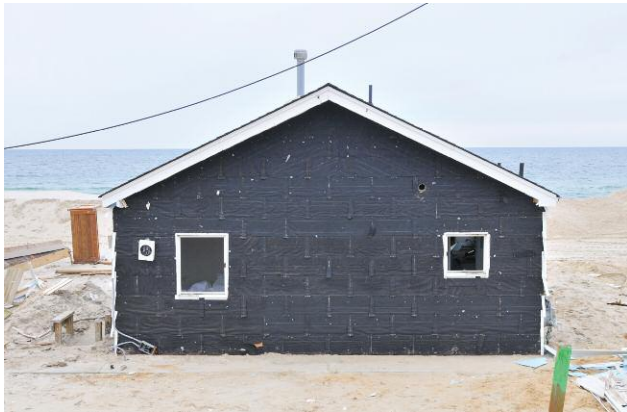
7 © DOUGLAS LJUNGKVIST